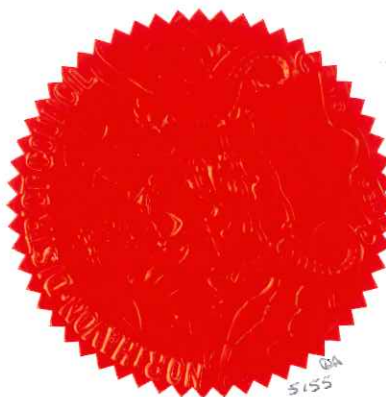
CLERK AND CHIEF EXECUTIVE OFFICER